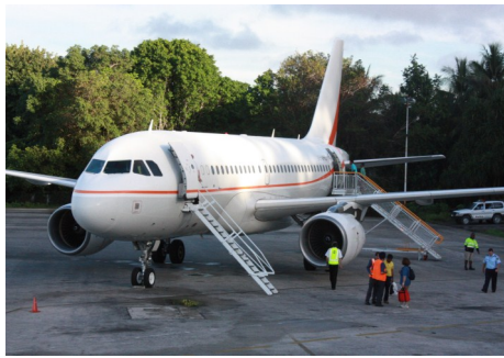
Asylum seekers on Nauru has reached 356

processing will begin or how long it will take.