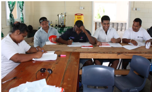
Five of the seven new recruits take notes on the second last day of training.

The training is one of a number of training initiatives under the departments' training and development program.