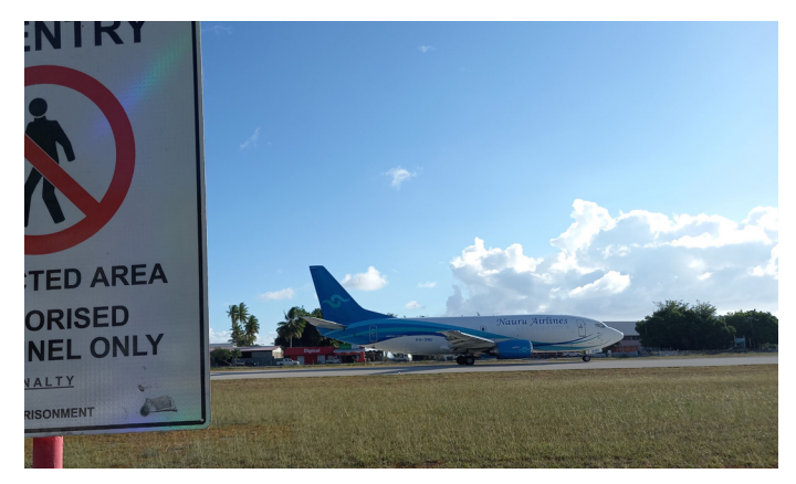
Government recognises the importance of maintaining air services and supports the airline with cash flow and the aircraft replacement program

The minister explains the total government debt liabilities have