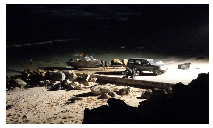
Minister urges fishermen to adhere to safey measures and maintain communications while at sea

The trailers are procured under the Artisanal Outboard Motor Fishers