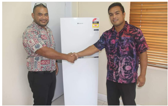
Nauru Fisheries donate fridge to childrens' ward purchased from fishing competition entry fees

The NFMRA donated also donated an ambulance in 2016 and medical equipment in 2018 •