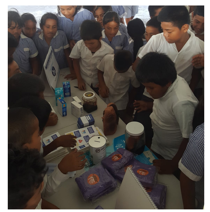
A 2015-16 survey shows 46.3 per cent of population are smokers

A total of 1,386 individuals, 95.2% Nauruans and 4.8% of other ethnicity participated in the 2015 survey.