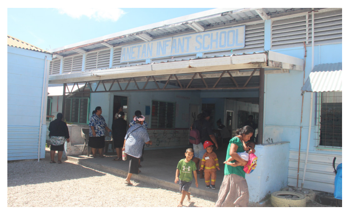
Teacher shortage is among the issues raised by schools in the region

While some countries that are still COVID-free, Deputy Minister Menke said all countries reported to have begun work on preparation and contingency plans for the possibility of COVID entering their borders.