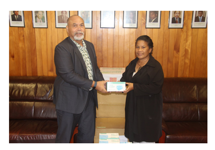
President Aingimea and Health Minister Dageago accept 30,000 masks from international energy trading company, Winson Oil Bumkering

The donation will assist Nauru greatly in its efforts towards mitigating the spread of disease and protects frontline workers and nurses administering Covid vaccinations.