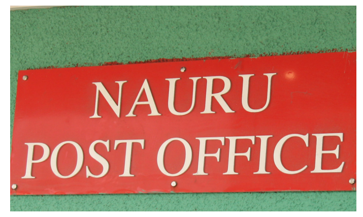
Nauru Post continues to build on services to ensure survivability and quality service

As Nauru Post continues to open doors and services to ensure