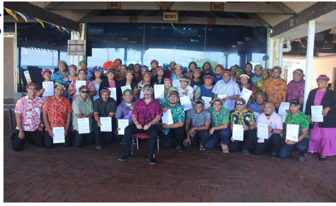
Graduates equipped with Australian-recognised workplace health and safety qualification

"This award is recognised in Australia and we are very pleased that there are so many graduates who have stuck out in order to attain this level of qualification. This course is designed to prepare candidates to enter the field of work health and safety in different industries," DM Appi said.