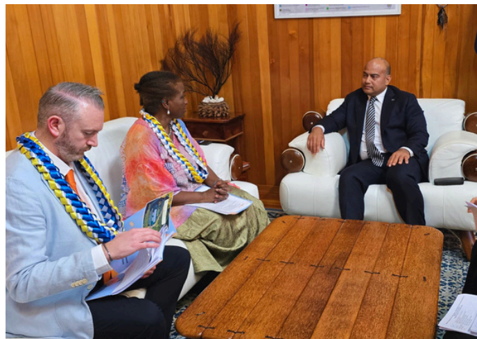
UNFPA's visit reaffirms the shared commitment to advancing reproductive health, gender equality, and the well-being of Nauruans

Appointed by UN Secretary-General António Guterres in 2017, Dr Kanem has more than 30 years of strategic leadership experience in the fields of preventive medicine, public and reproductive health, social justice and philanthropy.