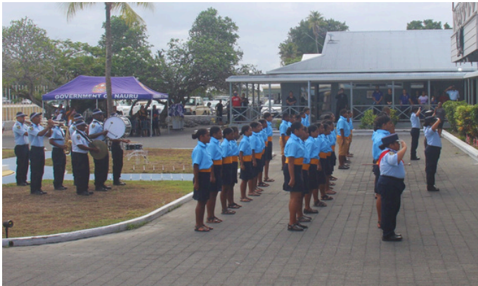
Students showcase their cadet skills after weeks of training with the NPF

Acting President Jesse Jeremiah and Acting Minister for Nauru Police Force (NPF) Charmaine Scotty witnessed and inspected the cadetship passout parade by Nauru College and the Sacred Heart College students in front of the government office, 11 and 13 December last week.