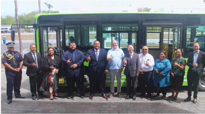
Climate minister Asterio Appi cuts the ribbon launching Nauru's first electric bus

Nauru launched its first-ever electric bus in front of the government office last week, edging closer to clean energy targets.