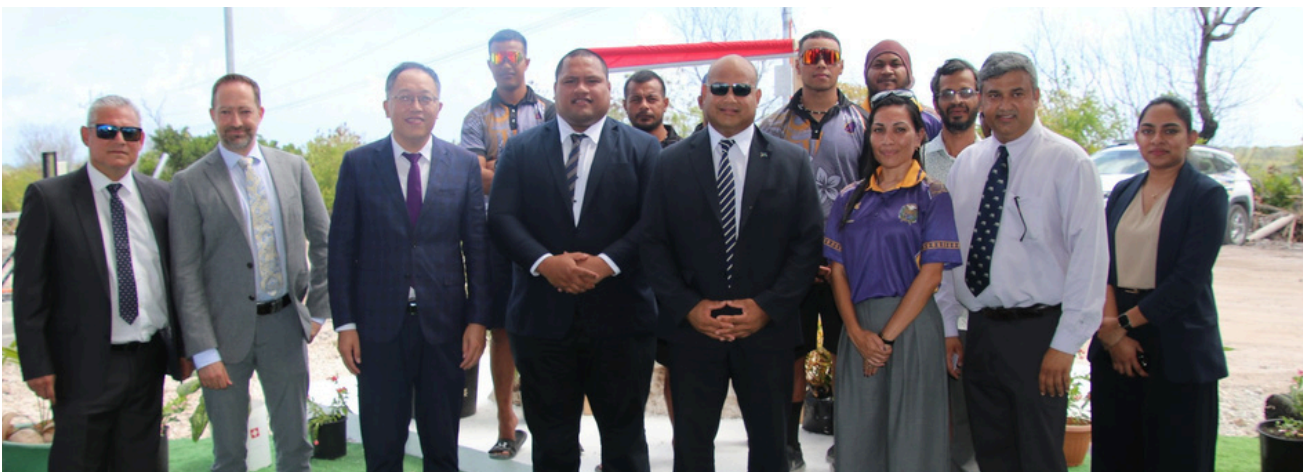
President Adeang with ministers and officials at the inauguration of the first Pacific Starlink Community Gateway