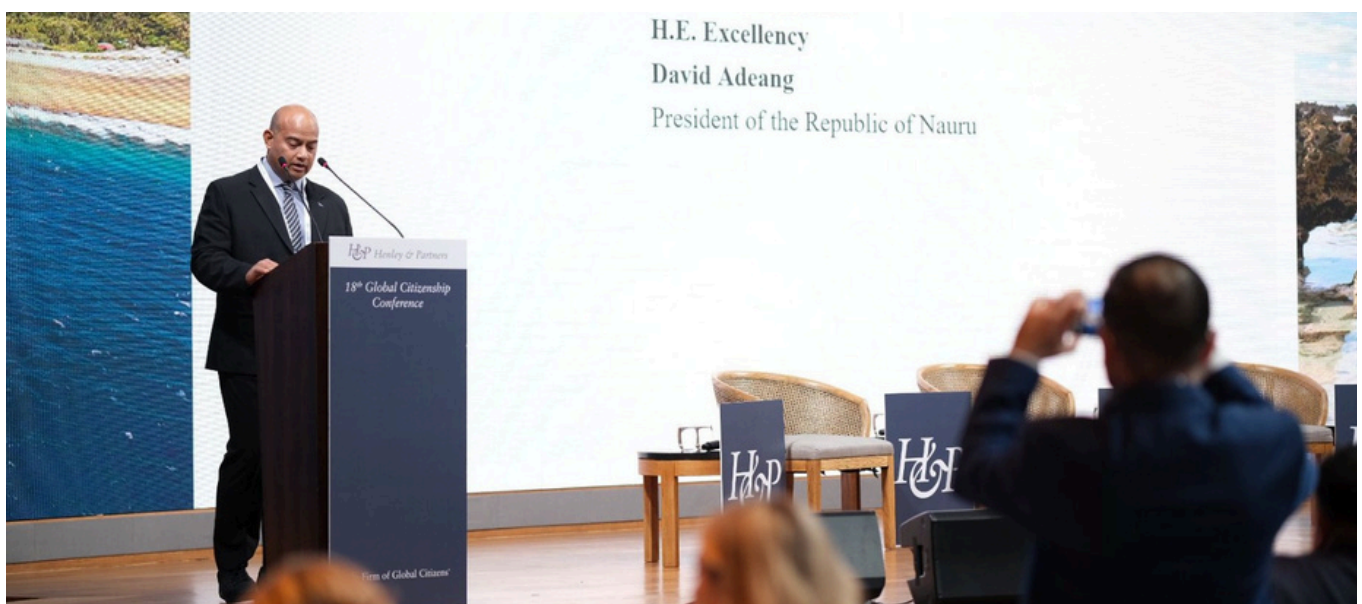
Nauru takes proactive steps to secure funding for a sustainable future through the new economic and climate resilience citizenship program

Despite so many challenges, President Adeang says Nauru refuses to be a victim of circumstance but rather will pioneer solutions that align global investment with climate resilience. //