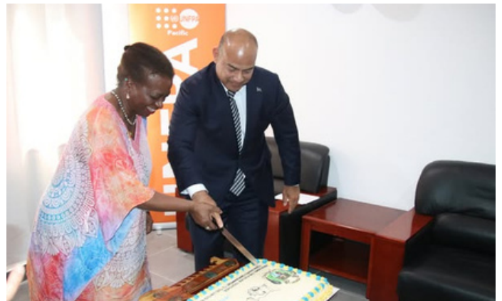
The office symbolises collaboration, trust, and shared responsibility to collectively achieve the SDGs and lift the lives of people, particularly the most vulnerable

His Excellency President David Adeang and Cabinet Ministers joined the UN Under Secretary General and UNFPA Executive Director Dr Natalia Kanem in celebrating the official opening of the United Nation's Nauru office, 6 December.