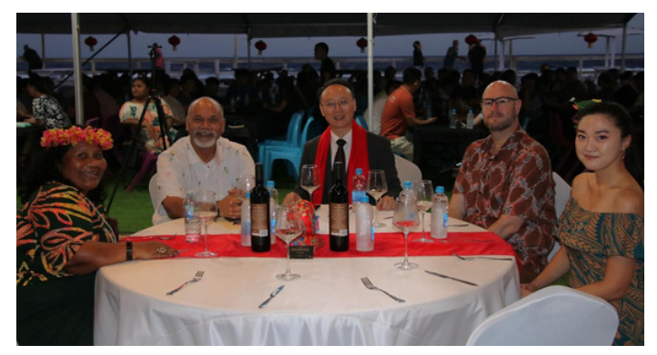
Ministers Aingimea and Scotty joined the celebration

Minister for Foreign Affairs Lionel Aingimea attended the reception hosted by Chinese Ambassador Lyu Jin marking the anniversary and coinciding with the celebration of the Chinese New Year, 24 January.