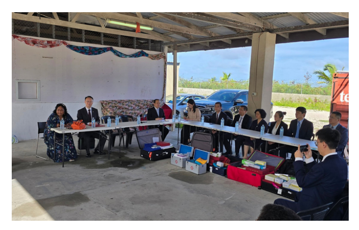
The first traditional Chinese medical team discuss ways forward in improving health care

Minister for Health Charmaine Scotty and her department welcomed the first traditional Chinese medical team to Nauru at the Naoero Public Health Centre, 17 January, and discussed the best ways forward in utilising the two practices.