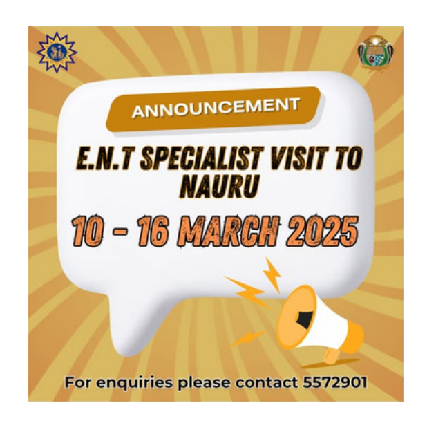
A team of otolaryngologist or ENT (ear, nose, and throat) specialists will be visiting Nauru from 10-16 March.

The diplomatic relations between the Government of the Republic of Singapore and the Government of the Republic of Nauru were officially established in March 2009.//