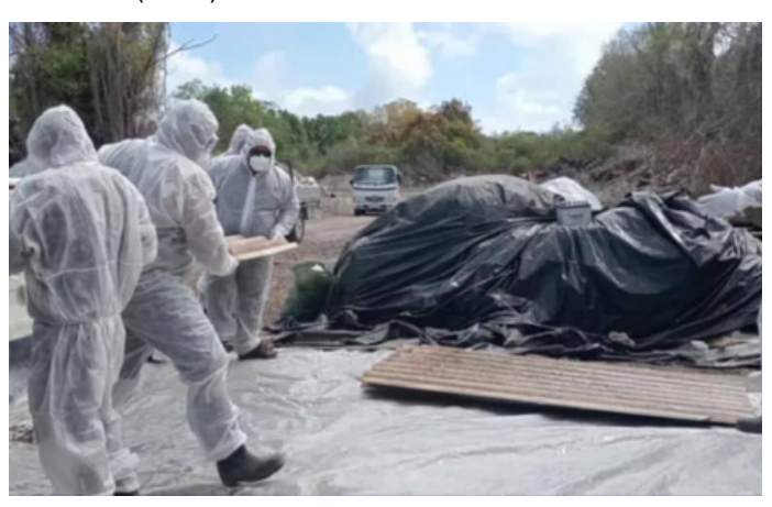
DEMA staff are actively working to ensure the safe removal of all ACM materials around the island

The Nauru Government through the Department of Environmental Management and Agriculture (DEMA) is conducting a major clean-up of asbestos-containing materials (ACM) around the island.