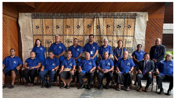
Talanoa sessions provide platform for leaders to share, discuss best ways forward for the region the Pacific way

“The Pacific region is blessed with vast ocean resources, and it is our responsibility to utilise them wisely to build a resilient and sustainable economy,” the President said underscoring the Blue Pacific’s vision where the future of Pacific nations is taking full ownership of its resources to secure long-term economic independence.