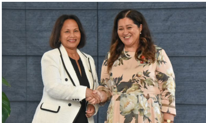
Solomon serves concurrently as high comm to Australia and NZ

Nauru accredited its first non-resident high commissioner to New Zealand, further strengthening the partnership of their two countries.