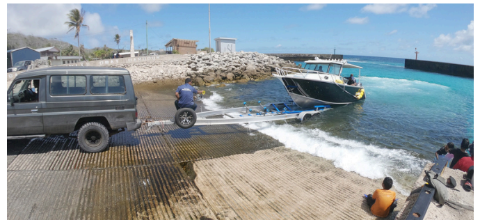
Fisheries is an important source of food and income for the Nauruan people

During Parliament in January, the Minister for Nauru Fisheries and Maritime Resource Authority (NFMRA) said staff of the state-owned enterprise underwent vital training and awaiting implementation of projects worth millions.