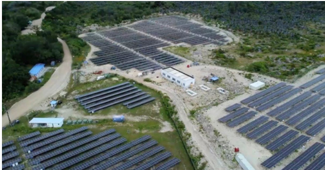
Solar farm site shared by the ADB and NZ government