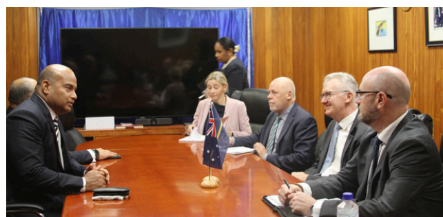
Australia commits to ongoing support for Nauru

The discussions underscore Australia's ongoing commitment to supporting Nauru and enhancing the special relationship between the two countries. //