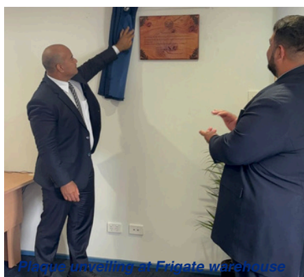
Plaque unveiling at Frigate warehouse

Frigate Cargo and Logistics Services (FCLS) officially opened its warehouse in Brisbane, Australia, with the plaque unveiling by His Excellency President David Adeang, 13 February, marking a significant milestone in Nauru's logistics ambition.