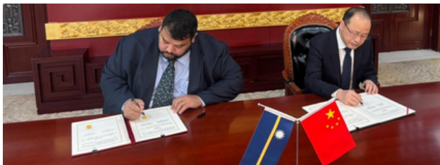
China MOU focuses on Nauru education

Nauru has signed agreements with China that will help boost and develop education, air services, and climate resilience.