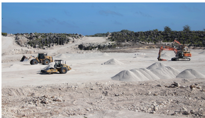
Land clearing for 2026 Micronesian Games stadium

During the January parliament sitting, Minister for Nauru Rehabilitation Corporation (NRC) Hon Reagan Aliklik informed the house that the NRC headquarters has been relocated from Civic Centre to the workshop building at topside, effective 27 January.