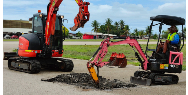
Work on analysing soil composition and integrity of runway

As part of the ongoing work to uncover UXO along the vicinity of the airport, Minister for Transport Reagan Aliklik told parliament in January that civil aviation's technical experts have collected soil samples beneath the airport runway on 12 different pits for the purpose of analysing the soil composition and the integrity of the runway.