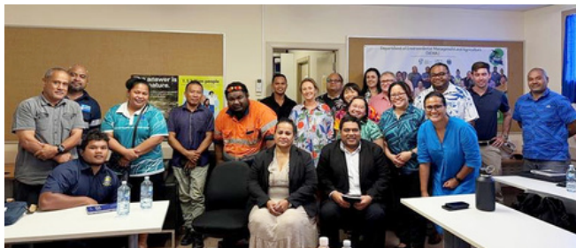
Departments collaborate to ensure project success

The Nauru Sustainable and Resilient Urban Development Project (NSRUDP) is Nauru's transformative project in partnership with the Asian Development Bank (ADB), as the country's first reticulated fresh water supply system.