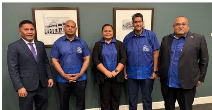
Heads of delegation of the Micronesian presidents' summit

HE President David Adeang was in Suva, Fiji last month for various meetings including the Micronesian Presidents' Summit, 21 February.