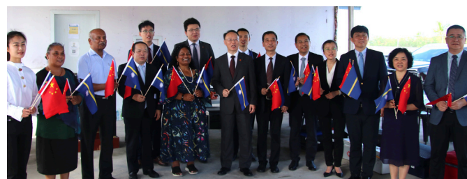
Health and traditional medicine to enhance healthcare options