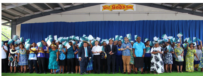
A select few will pursue onward training abroad

Over 700 graduates of the latest Alternative Pathways Program (APP), received their certificates of attainment that will broaden their opportunities for further studies and employment, 7 February. This is the largest graduating cohort in the history of Nauru, surpassing the previous program's record.