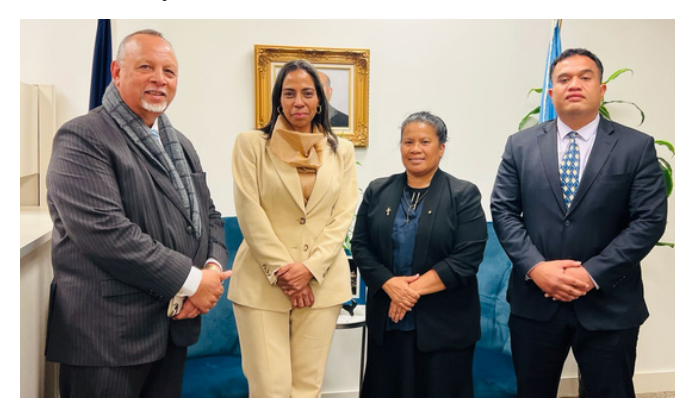
(L-R) ISA Ambassador David Aingimea, ISA SG Leticia Carvalho, Deputy Minister Isabella Dageago, Deputy Minister Delvin Thoma.

The meeting underscored a collective commitment to effective ocean governance, with aspirations to strengthen collaborative efforts and engage with Nauru and other key stakeholders.