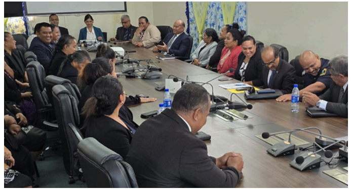
The President encouraged HODs to lead by example - fostering strong work ethics and responsible leadership

She advised that the vehicle policy will be updated to ensure appropriate use and monitoring of government vehicles. Staff were also encouraged to consider vehicle sharing and make use of the free bus service provided for public servants.