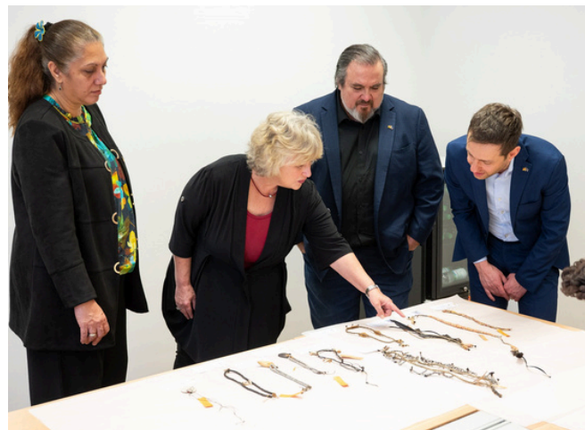
Ambassador Pitcher visits Museum in Germany

Nauru's Ambassador to the United Nations in Geneva was welcomed to the German state-owned Museum 5 Continents in Munich, Germany, to view the Nauru collection rarely seen by the general Nauru population, 24 March.