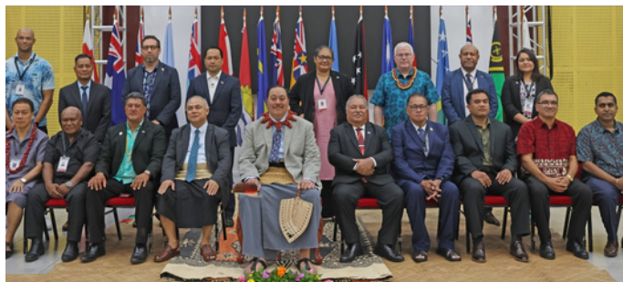
Nauru confirm commitment to sign PRF treaty

The Republic of Nauru continues to demonstrate its commitment to regional development and resilience and as a prominent advocate for the Pacific Resilience Facility (PRF), has taken significant steps toward fostering long-term sustainability in the Pacific region.