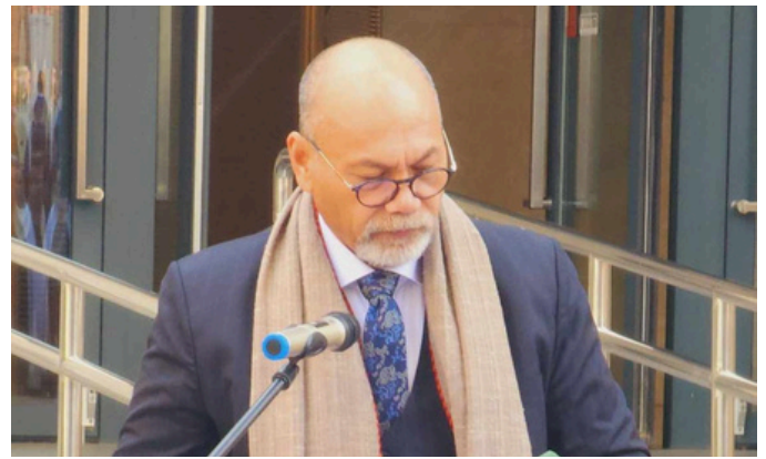
Foreign Minister Aingimea thank China for support in embassy establishment

Minister Aingimea also thanked the Government and people of China for their assistance and support, which enabled the