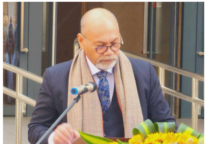
Foreign Minister Aingimea opens Beijing office

“Together, we are making significant strides toward a healthier Nauru. These initiatives will profoundly impact the lives of our citizens, and I am confident that, with your support, we will achieve our goals,” Minister Eoe said and acknowledged the invaluable contributions of Minister Charmaine Scotty for the efforts and commitments that laid the foundation for the work done. //