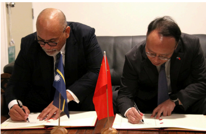
Visa exempted for diplomatic and official passport holders

Minister for Foreign Affairs and Trade Lionel Aingimea and Chinese Ambassador to Nauru Lyu Jin, officially signed an Agreement on Mutual Visa Exemption, 22 March.