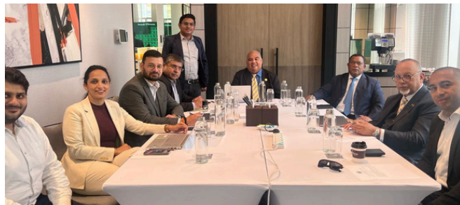
RonPhos positions its contractual conditions of supply to ensure that quality penalties are limited in order to produce greater profitable returns.

Minister for RonPhos Shadlog Bernicke formalised a phosphate sale agreement with Kalyaan Resources DMCC, a registered general exporter in Dubai primarily engaged in the trading of phosphate and other minerals globally, 16 April.