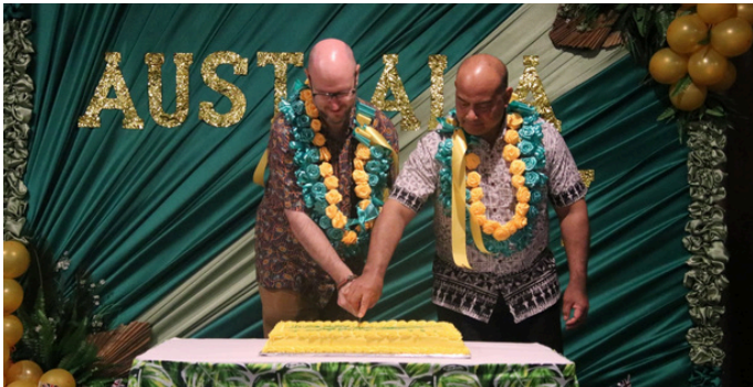
High Commissioner Barclay and President Adeang cut the Australia Day cake

His Excellency President David Adeang and cabinet ministers attended belated Australia Day celebrations, 16 April, hosted by the new High Commissioner, Matthew Barclay with speeches highlighting the close partnership and the Nauru-Australia Treaty.