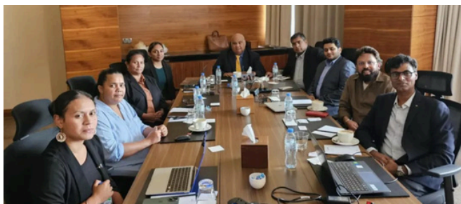
The railway restoration will potentially create jobs and reduced fuel consumption and emissions