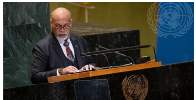
The resolution sends a strong message of the importance of judges' well-being

The resolution builds on global efforts, including the UN