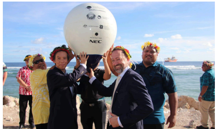
The cable will bring social and economic benefits for the government and people.

Nauru marked a significant milestone in its digital transformation with a ceremony celebrating the landing of the East Micronesia Cable System (EMCS), 9 August.