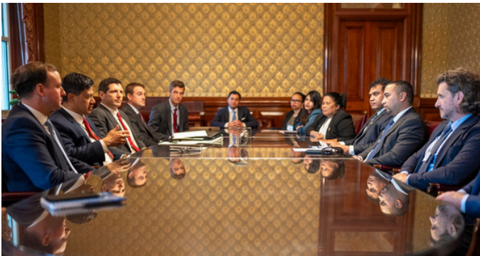
The US administration reaffirmed support in expediting the process of TMC's application with NOAA

A Nauruan government delegation held high level talks at the White House with top US government officials early August, as part of the government’s aim to build stronger economic ties with the global superpower.