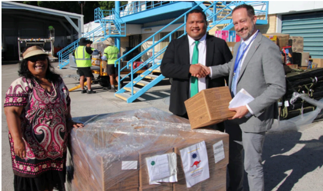
(L-R) Minister Scotty and Minister Jeremiah receive the methoprene briquette from Aust Deputy High Commissioner Close.

As part of Australia's on-going commitment to regional health and resilience under the 'Ranga Timorum' program, Nauru has received a donation of 10,000 methoprene briquettes from the Government of Australia to strengthen efforts in the country's fight against the ongoing dengue outbreak, 7 August.