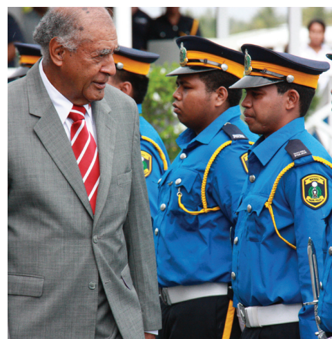
Ratu Epeli Nailatikau inspects the Nauru Police Guard of Honour

Ratu Epeli also offered thanks for His Excellency's strong support for the Pacific Islands Development Forum (PIDF) and Nauru's work as a member of the governing council.