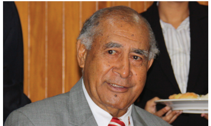
Fiji President Ratu Epeli Nailatikau's state visit to Nauru is part of a pacific island tour to strengthen relations and cooperation with the region

The official delegation departed early Friday (14 Feb) morning back to Fiji. The president and his delegation were in Kiribati prior to visiting Nauru. The state visit was part of a pacific island tour by the Fiji President to strengthen cooperation and relations with the region•