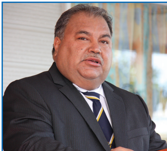
His Excellency President Baron Waqa makes his first national address as president during Nauru's 46th Independence day flag raising ceremony

with strong functioning law and order in line with Nauru's National Sustainable Development Strategy."