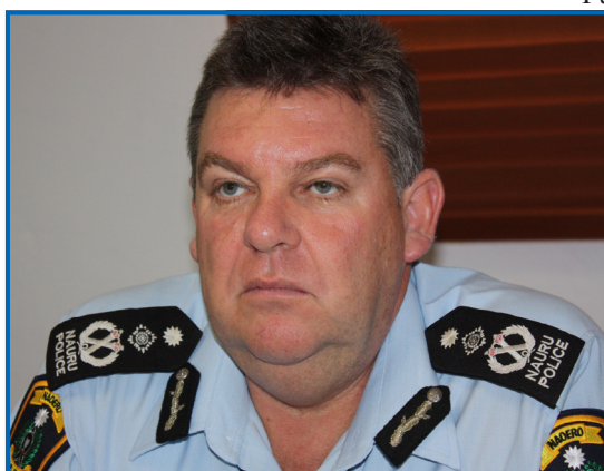
Police Commissioner Richard Britten cautions that tougher action is needed to reduce road accidents

But Christmas 2012 saw an increase in parents purchasing motor scooters for children under this age. This was a very irresponsible thing that parents have done.