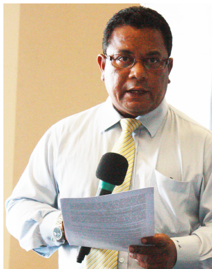
Fisheries Minister Hon Marcus Stephen officially launch workshop and expresses the importance of protecting Nauru's fisheries and aquaculture ecosystems