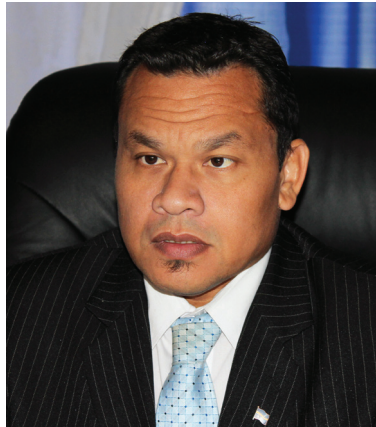
H.E. Sprent Dabwido, MP in the Presidential Office during his Address to the Nation