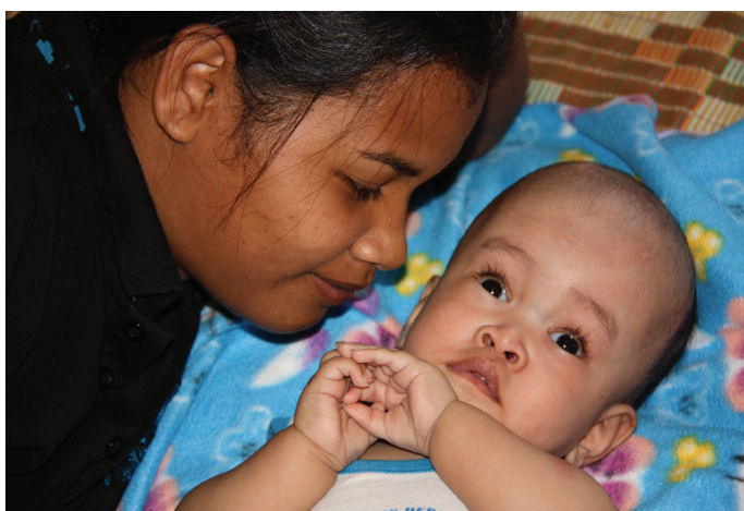
Mum Pancy and baby relax after a rehabilitation session at home

Spina bifida is a birth defect that causes damage to nerve signals to parts of the body as well as affect a wide range of muscles, organs and bodily functions•