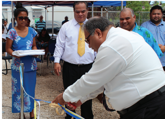
President Waqa cuts the ribbon unveiling the new 300 solar panel reverse osmosis plant

The ceremony took place last week (8 October) at NUC headquarters with His Excellency President Baron Waqa and several cabinet ministers in attendance to cut the ribbon officially opening the new facility.