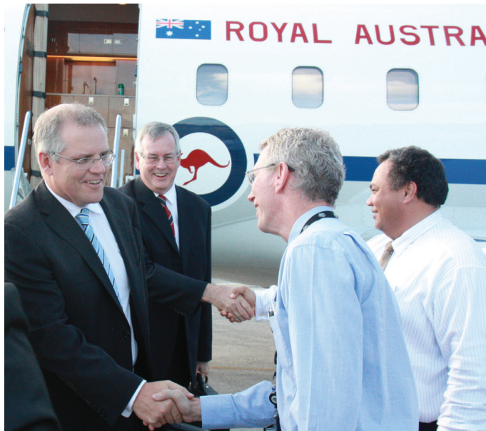
Australia's Minister for Immigration and Border Protection Scott Morrison is met at the Nauru airport by Nauru officials last week (9 Oct) to deliver his government's new policy on illegal boat arrivals

This is Mr Morrison's first trip to Nauru as an Australian government minister•