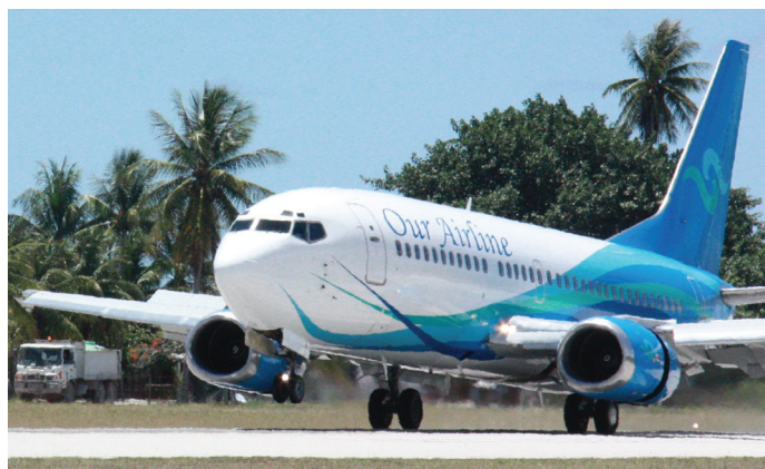
Our Airline's third aircraft VH-PNI made its first flight to Nauru on 9 October

The new aircraft has equal capacity as the other planes in the fleet with 134 passenger seats and a cargo capacity of three tonnes.