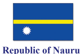
Republic of Nauru

The GIO was established in May 2008 and is a section of the Office of the President.