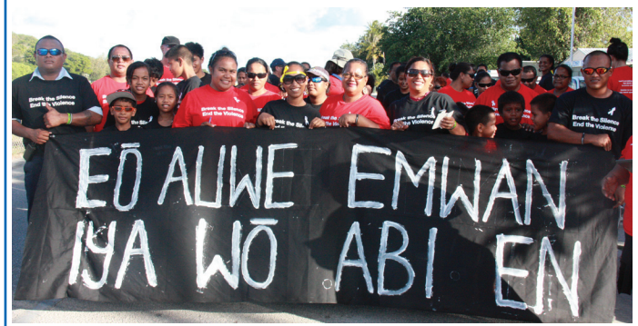
Supporters of White Ribbon hold up a banner that reads: "You are not a man if you abuse females," just prior to starting the walk from the government office to Centennial hall on 25 Nov

Presentations were made and refreshments served at the end of the walk.