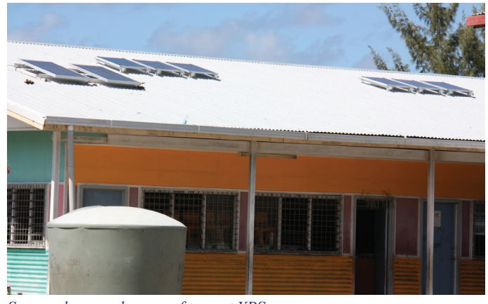
Some solar panels on roof tops at YPS