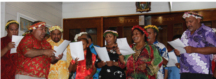
President Baron Waqa (front left) leads cabinet, caucus and parliament staff in a Christmas carol