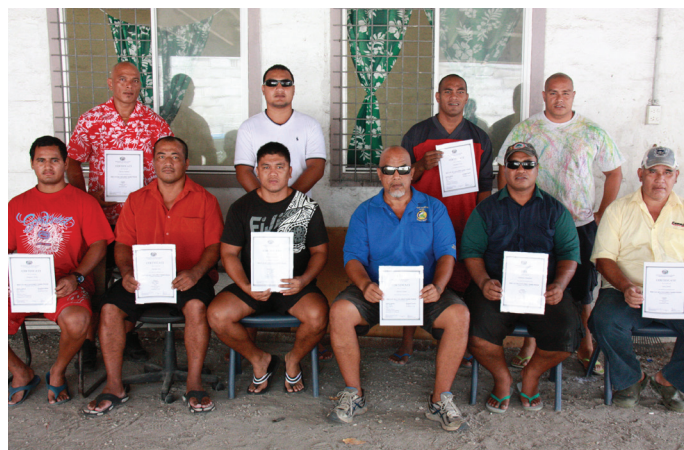
Corrections inmates with their certificates attained under the Work and Life Development Training program

The program began earlier in the year (4 March) and finished this month (2 Dec)•