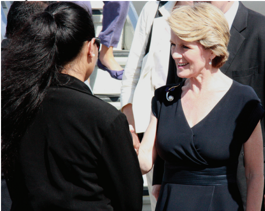
Australia's Minister for Foreign Affairs Julie Bishop greeted on arrival last week (18 Dec) by Nauru DFAT staff

The protocol welcome at the government office shortly after arrival included the playing of national anthems of Australia and Nauru and an inspection of the all-female police honour guard.