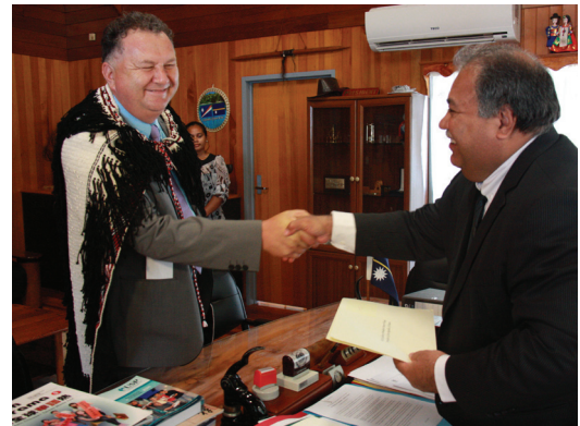
NZ High Commissioner Shane Jones shakes hands with President Waqa following the presentation of his letter of credence

“We are appreciative of New Zealand’s assistance to Nauru over the years especially when not too long ago, Nauru hit its financial crisis. New Zealand was among other countries that provided assistance through PRAN [Pacific Regional Assistance to Nauru] to help Nauru recover.