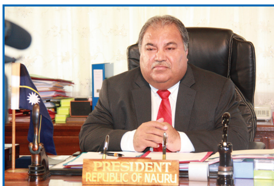
President Baron Waqa during His Excellency's live national address announcing decision of Firebird case

However, President Waqa cautions that while Nauru has won the appeal today, it is not the end, adding that Firebird can take the case against Nauru for $30-million in bond repayments further to the High Court of Australia.