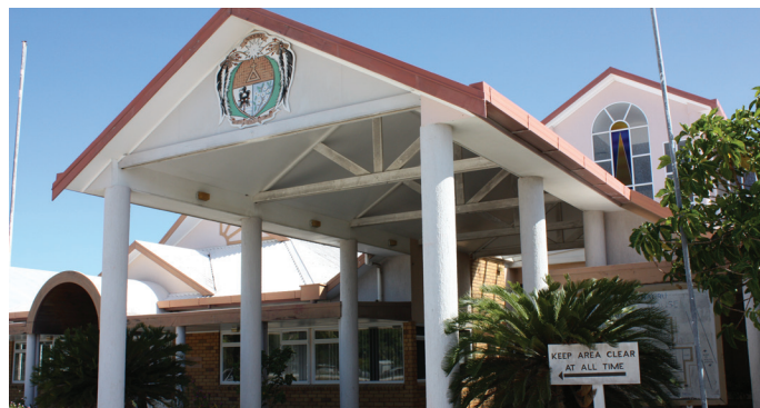
Parliament of Nauru

Ministerial statements presented on the day of the sitting will be circulated via GIO email distribution•