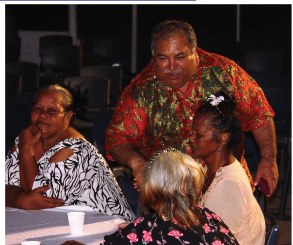
President Waqa greets guests at the President's Christmas Banquet on 23 December