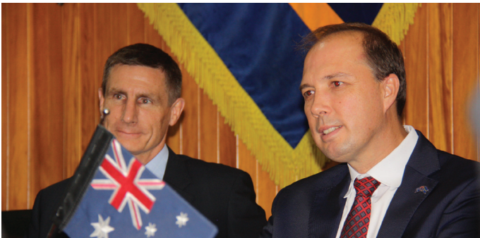
Australia's Minister for Immigration Peter Dutton (R) and Lieutenant General Angus Campbell in a meeting with President Waqa and Nauru officials