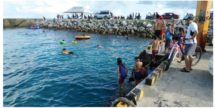
Anibare Bay harbour is one of the most frequented by locals, refugees and asylum seekers where members of the Nauru Surf and Life Saving Club keep watch most of the day.

Prior to participating in Open Centre, all asylum seekers will have been given training and education about Nauruan culture, general behaviour and conduct, and boundaries around private