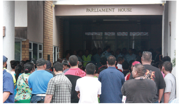
Police block protestors outside parliament house during the two days of protest (16 and 17 June)

The two men appeared in the Nauru District Court on Saturday 20 June, where they submitted an application for bail.