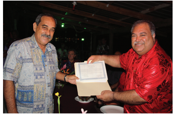
FSM President Peter Christian presents the air carrier permit for Nauru Airlines to President Baron Waqa at the flight inauguration reception hosted by Nauru Airlines in Pohnpei

President Waqa was personally encouraged with the partnership between Majuro and the FSM and the development of air services in the region.