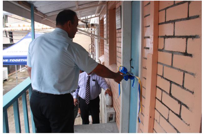
Minister for Justice and Border Control David Adeang cuts the ribbon at the official opening of the new quarantine office