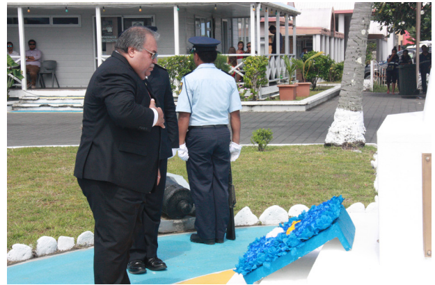
His Excellency President Baron Waqa lays the first wreath on Armistice Day