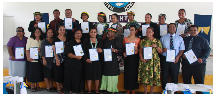
Twenty-four students graduate in Professional Certification IV in Human Resources from the Australian Human Resources Institute