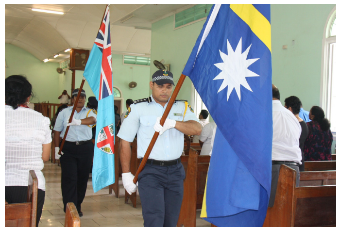
NPF flag bearers exit the church service with the Nauru and Fiji flags

Police Remembrance Day was initiated in April 1989 during the Conference of Commissioners of Police where it was unanimously agreed the service would be held on 29 September each year, the feast day of Saint Michael the Archangel Patron Saint of Police•