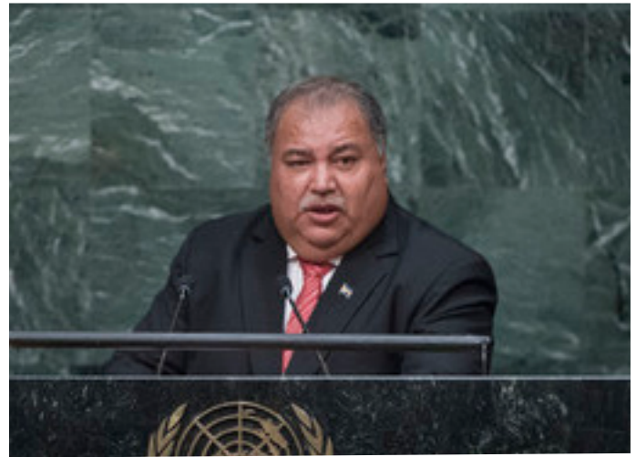
President Baron Waqa addressing the UN General Assembly

“In addition, relevant organs of the United Nations should conduct an assessment of their capacity to respond to the security implications of climate change,” President Waqa said in his statement.