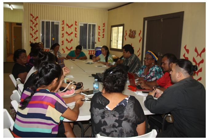
Participants at the historical society committee meeting

The training is in line with the Nauru Government's priority areas to up skill its public service•