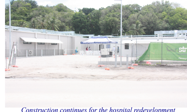
Construction continues for the hospital redevelopment

His Excellency also thanked State owned enterprises for providing advice and support as well as the governments of Taiwan, Japan and Turkey for their contribution of beds and equipment.