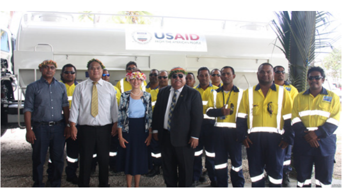
U.S donated fresh water delivery trucks are a much meeded assets during Nauru's dry spell

In her address, Ms Cefkin noted that climate adaptation is one of the highest priorities of USAID in the Pacific islands