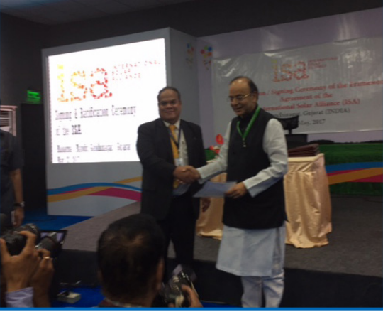
Minister for CIE Aaron Cook hands over the signed International Solar Alliance agreement to India's Finance Minister Arun Jaitley

Nauru's maximum power demand is 5.2 megawatts with annual energy