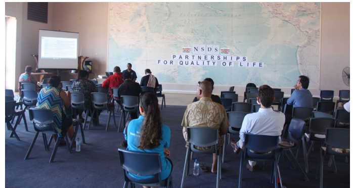
National consultations for review of the National Sustainable Development Strategy (NSDS) commenced on 23 August

While the review of the NSDS has been carried out in previous years, the vital feature of this process, is the effort by the Ministry of Finance to establish a multi-sectoral working group to review the documents and lead the public consultations. This was largely to ensure that Nauru takes ownership of its development path. The commitment by the TWG to ensure a truly inclusive