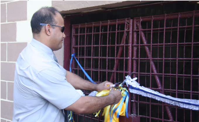
Acting President and Minister for Justice Hon David Adeang officially launches the Menen water reticulation project

Then Acting President and Minister for Justice Hon David Adeang officially launched the project in the ribbon cutting ceremony on 22 August.