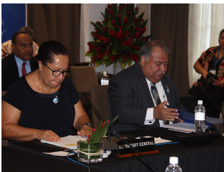
President Baron Waqa chairs SIS meeting with PIF Secretary General Dame Meg Taylor

The meeting of leaders of Smaller Island States (SIS) was the first of a series of meetings during the Forum week.