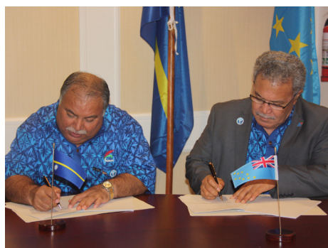
President Baron Waqa and Tuvalu PM Enele Sopoaga sign the agreement for the sale of Nauru boulders to Tuvalu as part of the country's coastal adaptation project

Nauru's President Baron Waqa and Tuvalu Prime Minister Enele Sopoaga signed an agreement for the sale of Nauru rock boulders as part of Tuvalu's coastal adaptation project to protect the country's newly reclaimed Queen Elizabeth II Park.