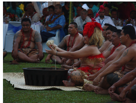
The traditional 'ava' ceremony was performed at the official opening ceremony of the 48th Pacific Island Forum meeting

The second day of the Forum week was the official opening of the 48th Pacific Island Forum leaders' meeting held at the grounds of the Robert Louis Stevenson Museum in Vailima, Samoa on 5 September.