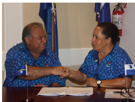
President Waqa and PIF SG Dame Meg sign the Green Climate Fund readiness grant project for Nauru

Nauru and the Pacific Islands Forum signed the implementation agreement in relation to strengthening Nauru's capacity and