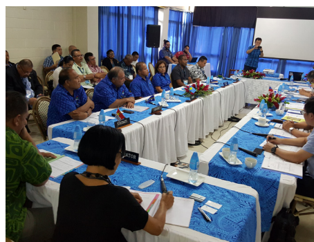
ROC Taiwan's Pacific allies call for renewed support and recognition of Taiwan at the dialogue

In his opening statement Mr Wu said that since Taiwan's engagement with the PIF, his country has worked with the Secretariat to promote development projects in areas of fisheries, energy, and education, to better serve the needs of the island states and the Pacific region.