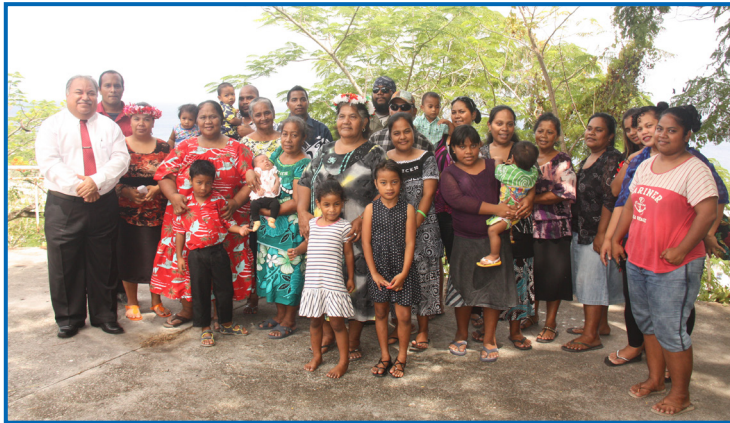
President Baron Waqa with proud landowners of portion 245 and 105, site for the new State House

President Waqa briefly outlined the background of the land lease agreement and the government's plans to develop the principle land and those extending