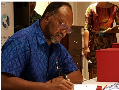
Vanuatu PM Salwai signs PACER Plus

The Vanuatu Prime Minister Honourable Charlot Salwai Tabimasmas signed the Pacific Agreement on Closer Economic Relations (PACER) Plus in Apia, Samoa on 7 September.