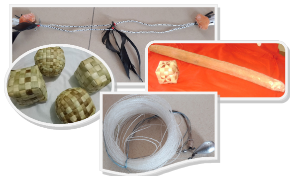
Nauru traditional sports attire and equipment

More sports equipment and traditional wear is required for Angam Day this year, and the Government of India donation will help to cover those ongoing expenses needed to continue to support the promotion of traditional sports play on Nauru•