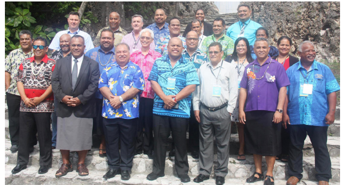
CPSC members, technical team and SPC secretariat staff with President Waqa at the opening of the CPSC AGM on 15 October