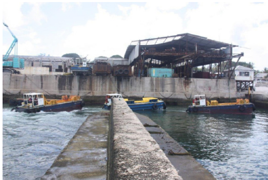
Demolition of the old port has begun in preparation for the commencement of construction of the new port facility

Minister Kam reported that the government has signed seven land portions in Aiwo and Denig for the port project. The tender award for the port development is expected to be announced in October.