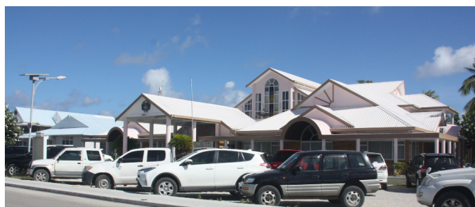
Nauru's Parliament House, Yaren district

President Waqa also highlighted other events during the UNGA that included Nauru and Germany convening the first ever ministerial